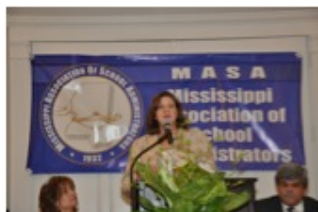
RENAISSANCE LEARNING CORPORATE SPONSOR