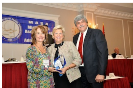
The University of Mississippi Institute for Education and Workforce Development